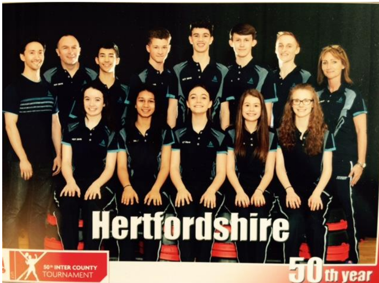
The Hertfordshire team and coaches at the 50 th ICT tournament